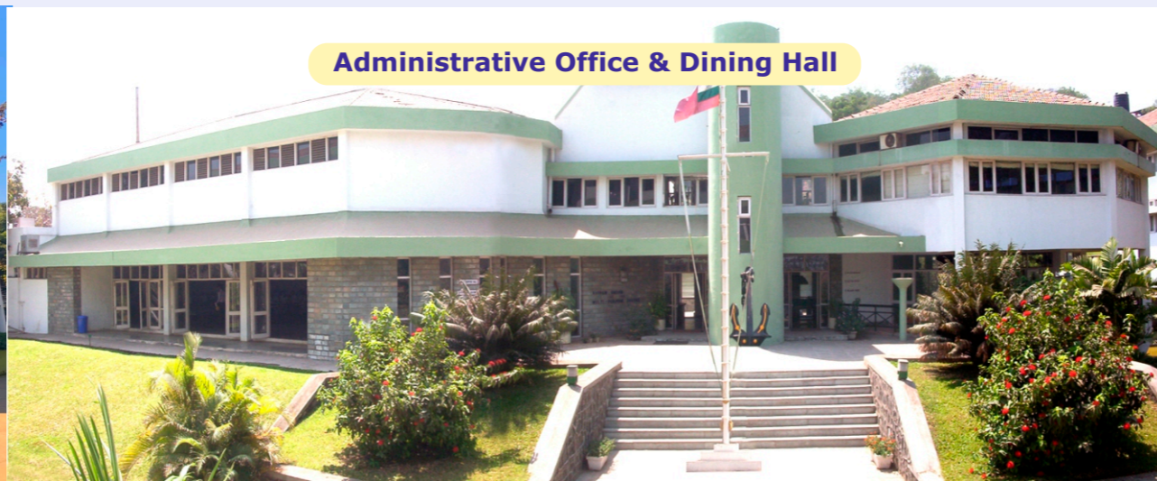
Administrative Office & Dining Hall