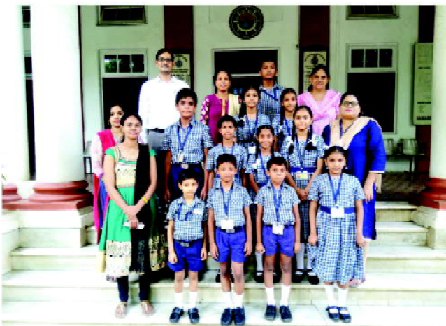
WINNERS OF HINDI ELOCUTION COMPETITION