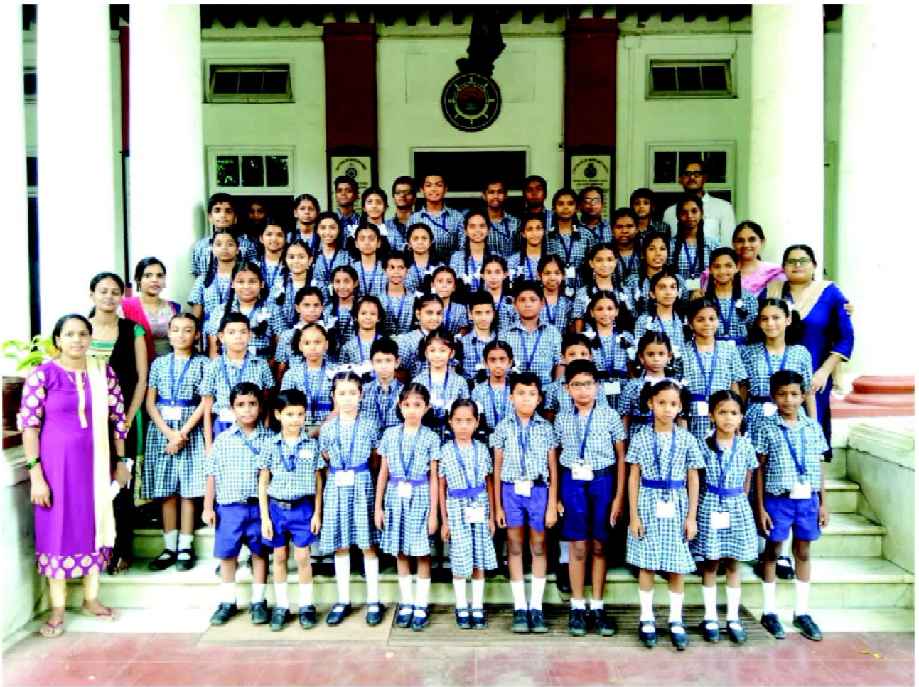
PARTICIPANTS OF HINDI ELOCUTION COMPETITION HELD ON 18TH JULY