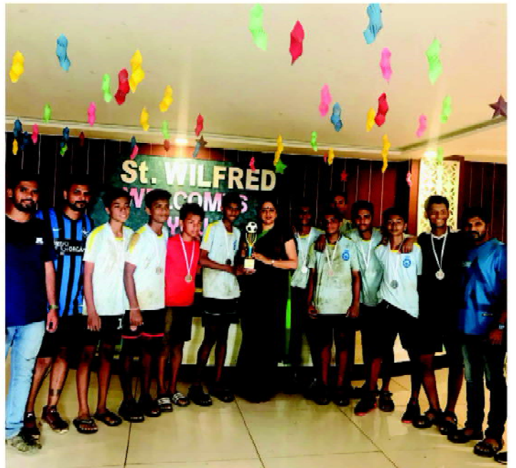
RUNNER UP OF FOOTBALL TOURNAMENT AT ST. WILFRED SCHOOL, PANVEL