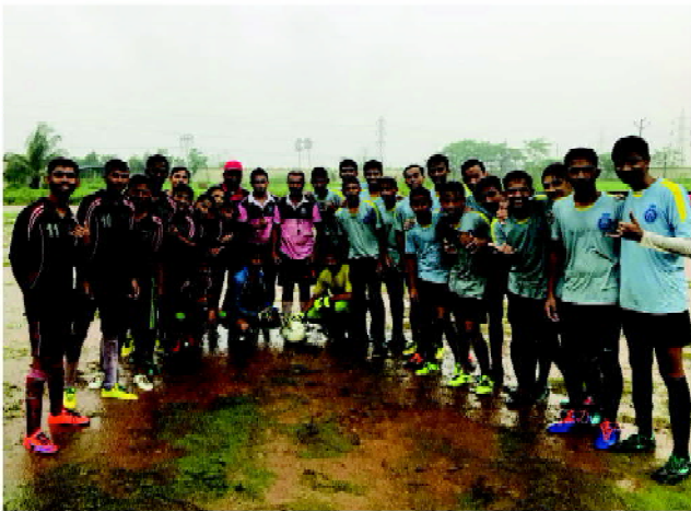
RUNNER UP OF U17 DISTRICT LEVEL SUBROTO MUKHERJEE FOOTBALL TOURNAMENT, KHOPOLI