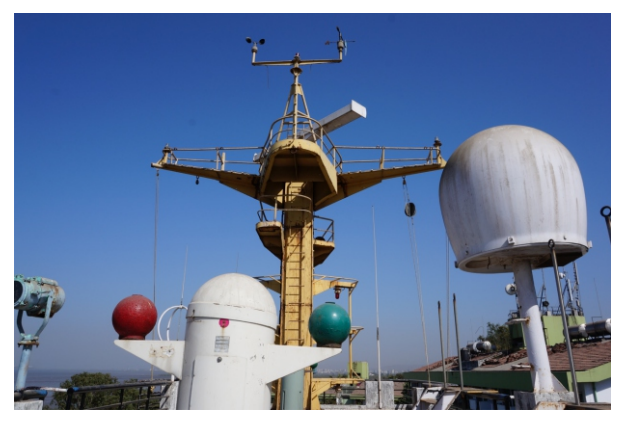
INMARSAT Dome Antenna